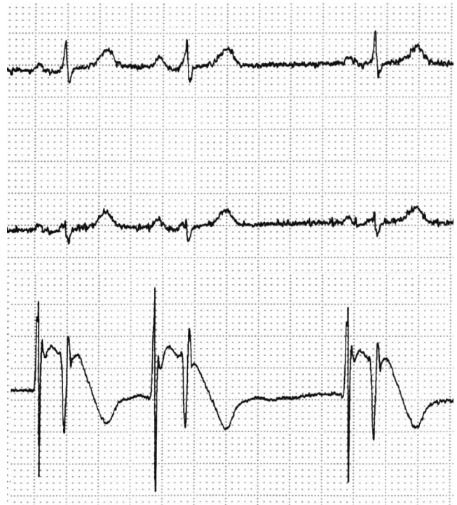
Figure 1. Unipolar intracardiac atrial electrogram from the tip of the electrode, which have to be recorded without filtering, either by hooking up to V1 of an ECG-recorder or measured with the pacing system analyzer (note that the Biotronik ERA 300 will record a filtered electrogram if you press P/R). Note that the lesion-potential of the P-wave is present while the screw is still "in".

During implantation, special care was taken for proper positioning of the tip which should be perpendicular to the atrial wall. Afterwards, the patient had bed rest for 24 hours. Dismissal followed usually the next day after checking and eventually reprogramming the pacemaker. A röntgen-thorax was performed in every patient. As a sign of good contact between the electrode-tip and the atrial wall the intracardiac atrial electrogram was observed, either on the pacing system analyzer without filtering, or on the ECG which could be