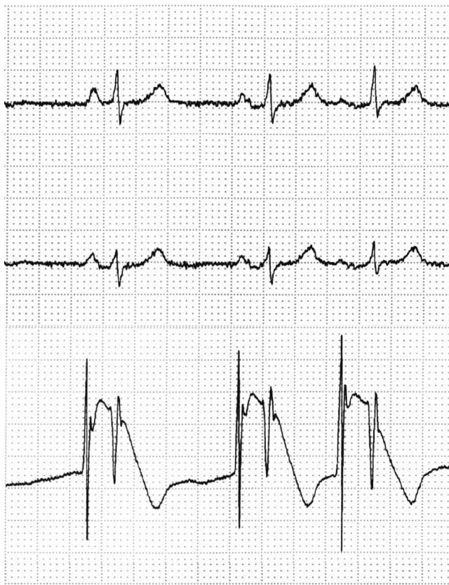
Figure 2. Unipolar intracardiac atrial electrogram from the tip of the electrode after the screw is turned "out". There is an increase of the lesion-potential. Note that in both recordings the remote signal of the ventricular activation is superimposed on the lesion-potential.

middle of the distal part of the tip of the lead (Figure 3). Atrial threshold, pacing impedance, and P-wave amplitude were measured with a standard pacing system analyzer (Biotronik ERA 300). For the observation of the lesion-potential, the intracardiac electrogram was recorded on the screen or in the print-out. When measuring the P-wave amplitude, the P/R button has to be activated, but, unfortunately, this changes the filtering characteristics which alters the morphology of the lesion potential. Therefore, special notice was undertaken to observe and record the lesion potential without filtering and measuring the P-wave amplitude with filtering. During follow up, all measurements were performed via the pacemaker (Biotronik INOS 2 CLS or ACTROS DR). The P-wave amplitude was defined as the lowest value during 10 seconds of recording, not as the average or highest value in the observation time.